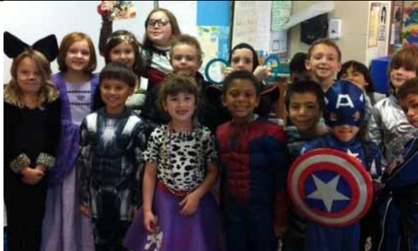
❄️ MERRY CHRISTMAS! and Season's Greetings.